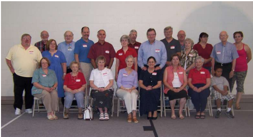
OVERHOLSER REUNION SATURDAY, AUGUST 1st, 2009 St. John's Center, United Church of Christ 432 Reading Road, East Earl, Lancaster Co., PA